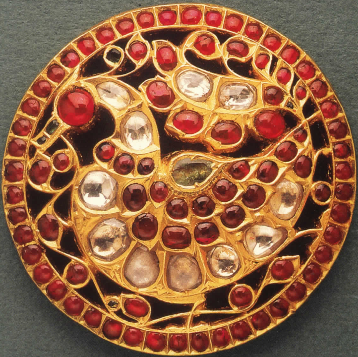
Tamil Nadu, Head ornament Gold, diamonds, rubies, fabricated, 19th century Collection: Mis, Brussels

ing ornaments for the top and back of the head and ornaments for the ear, neck, torso, waist, fingers, wrist and ankles.