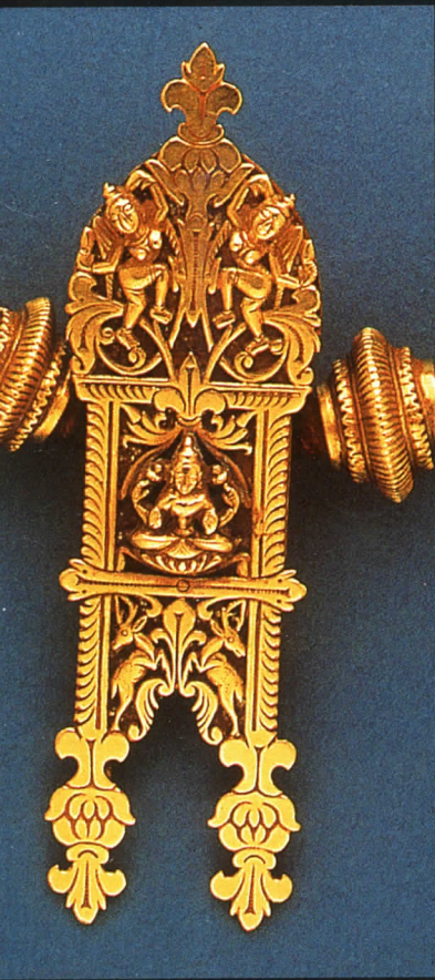
Tamil Nadu, Gold necklace, fabricated, 19th century Collection: Ghysels, Belgium

Both Grown-ups' and Children's Programs at the BGC: Programs for children ages 6 to 12 and their adult companions will be held to complement the exhibition. Activities will include gallery tours and art workshops in which each participant will create an object inspired by the pieces in the exhibition. Please call 212-501-3011 for program dates and details.