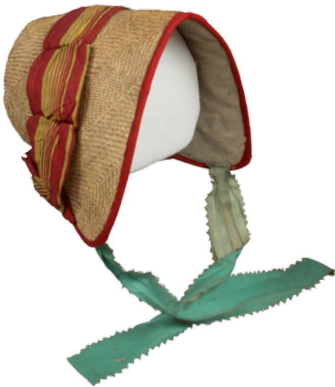
Woman's bonnet. Ni-Vanuatu culture, Aneityum, Vanuatu, late 19th century. Pandanus leaf, cotton, cotton ribbon, newspaper.

Exhibition tours are offered Tuesday through Friday between 11 a.m. and 4 p.m. and Thursday until 7 p.m. Reservations are required for all groups. To schedule a tour, please call 212.501.3013 or e-mail tours@bgc.bard.edu .