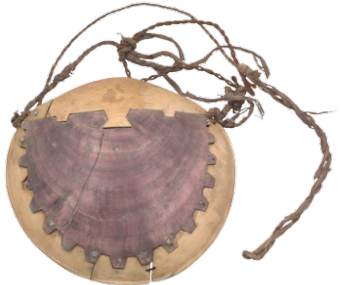
Civitabua , or civavonovono (breastplate). Fiji, late 19th century. Pearl oyster shell, sperm whale tooth, white metal, plant fiber. Courtesy of the Division of Anthropology, American Museum of Natural History, 80.0/2061.

Both the exhibition and the accompanying book explore the intellectual, cultural, and political realities of collection histories in Oceania. In the late