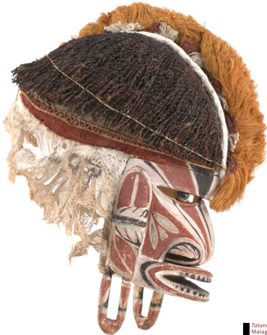
Tatanua (mask for funerary ceremony). Malagan culture, New Ireland, Nusa Island, Papua New Guinea, late 19th century. Wood, shell, pigment, plant fiber, seed, resin, bark cloth, paper. Courtesy of the Division of Anthropology, American Museum of Natural History, ST/ 691.