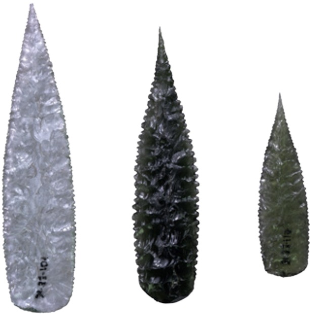
Glass points. Murchison district, Kimberley region, Western Australia, Australia, 1908. Glass.