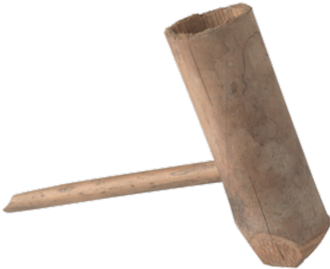
Child's imitation pipe. Arapesh culture, Aitape district, Papua New Guinea, early 20th century. Reed wood. Courtesy of the Division of Anthropology, American Museum of Natural History, 80.0/6981.

and the objects they manufactured in the Stone Age phase of human development. Crucially, if the objects collected or simply recorded in observations exhibited more advanced techniques or materials, they were usually written off as evidence of the degeneration of culture, inauthenticity, and the destruction of tradition.