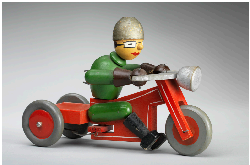
Motorcycle and rider, 1940–50. Wood, metal. © Roma Capitale – Sovrintendenza Capitolina ai Beni Culturali – Collezione di giocattoli antichi, CGA LS 9522. Photographer: Bruce White.

The Materiality of Wood and the Making of Swedish Toys: Carpentry and woodworking were necessary occupations in Sweden's historically agricultural society. Children learned the skills of carving, sawing, and joining both at home and through obligatory handicraft courses. Objects in this section include a full-scale workbench, tools, and carved parts for a large rocking horse, as well as jigsaw-cut toys, such as a jointed horse and rider and a large homemade model-bookcase of a suspension bridge. There are also a number of objects made by children themselves.