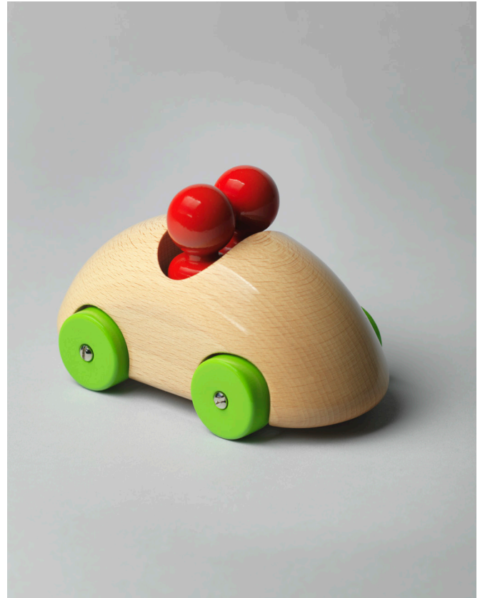
Ulf Hanses for Playsam. Streamliner Rally, introduced 1984. Wood, metal. Private collection.

In eighteenth- and nineteenth-century Sweden, wooden toys were the ordinary amusements of the poor. Carving small animals from the plentiful resource of wood was a traditional occupation for rural Swedes. By the mid-nineteenth century, as the cult of childhood innocence surged, the Swedish toy industry produced wooden animals, carts, dolls, sleds, and furniture for a rapidly growing domestic market.