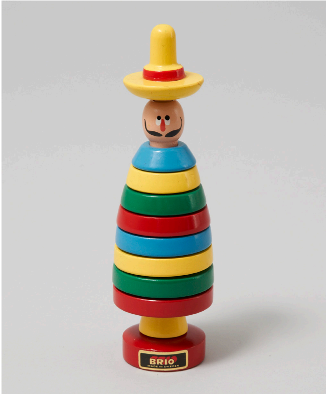
BRIO. Mexi stacking toy, introduced 1954. Wood. BRIO Lekoseum.

and embargo stimulated the market for Swedish goods. Exports, primarily to neighboring Nordic countries, increased and eventually spread to the United States and Great Britain. The products of the major Swedish toy manufacturers Gemla, Micki, and BRIO are a central focus of the exhibition, but many amateur-made objects reflect the particular inventiveness of the Swedish experience.