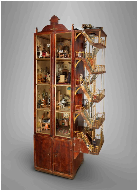
John Carlsson. Dollhouse and furnishings, 1912. Belonged to Elsa Carlsson. Wood, glass, metal, various materials; wired for electricity. © Roma Capitale – Sovrintendenza Capitolina ai Beni Culturali – Collezione di giocattoli antichi, CGA LS 32. Photographer: Bruce White.

The Horse: The horse was the backbone of the rural Swedish economy until the early twentieth century, and its form became common as a child's toy. Among the many horses in this exhibition are traditional painted horses and a broad selection of rolling and rocking horses produced by both amateurs and Gemla, the largest nineteenth-century manufacturer. The painted Swedish horse was not only a favorite plaything, but it also became a recognized symbol of Sweden itself in the twentieth century.